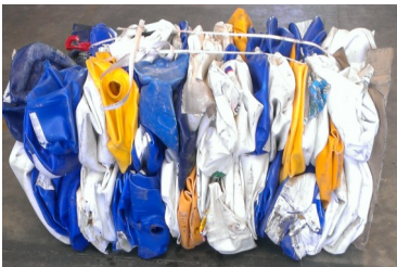
90 Plastic Drums

The LS150 is the latest addition to our baler range. LS150 is a multi- role baler, designed to bale a multitude of different materials without any baler modifications. The same baler configuration can be used to bale plastic, cardboard, PET bottles (lid on), steel drums and plastic drums. Tyres can be baled using specified strapping. An optional removable bin enables LS150 to crush waste material that can't be baled such as glass and small electrical appliances (following all required material safe handling practices). Bales can be tied off at any height. This facilitates effective use of the baler where one site has small quantities of many waste streams.