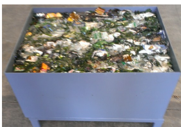
210kg of Crushed Glass