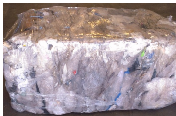
122 kg of Plastic