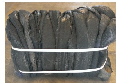
34 Car Tyres